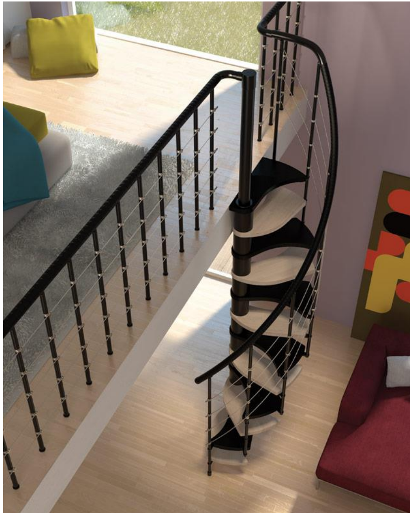
Space Saver Spiral Staircase Type "Trio 180"