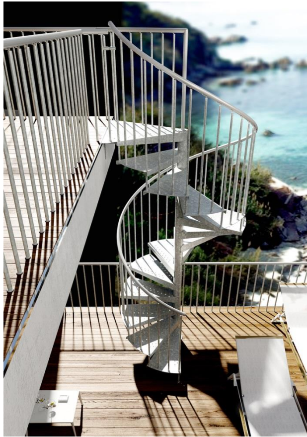
Spiral Staircase Type "Firenze Zink"