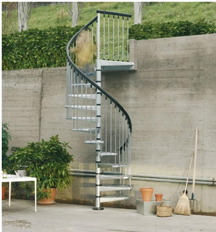
Exterior Spiral Staircase Type "Zola"