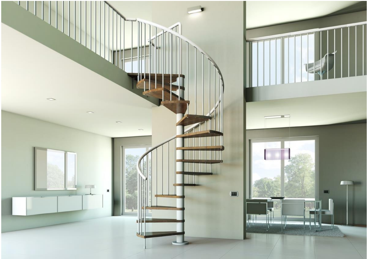
Wooden Spiral Staircase Type "Capri"